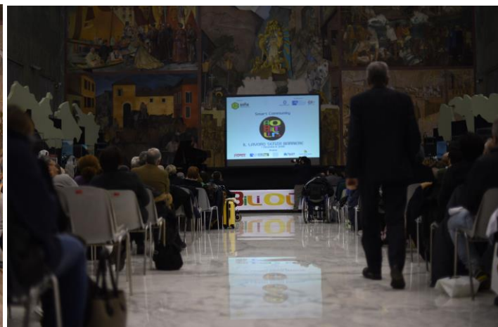
Smart Community Presentation Evening Museum of Popular Arts and Traditions of Rome